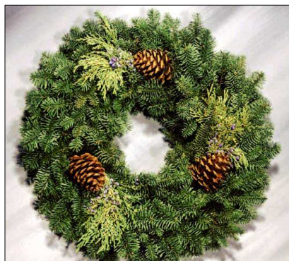
24 in. wreath: $19