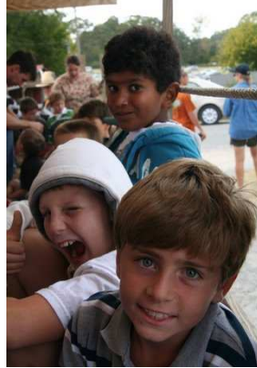
Above right & left and to the left: Cagle's Dairy Farm trip for PALS and Junior Choir