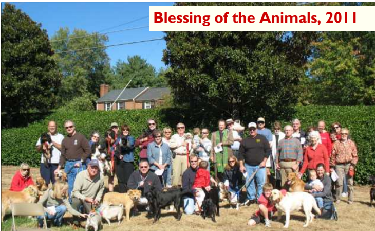
Blessing of the Animals, 2011