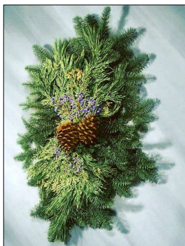
Door Charm: $14

Get a jump-start on your Christmas decorating by ordering fresh evergreen Christmas Wreaths and Centerpieces through St. David's BSA Troop 430. Stop by the table display on the Jeffords Hall bridge on Sunday, Oct. 16 th , and Sunday, Oct. 23 rd , to place your pre-paid order. Evergreens will be ready for pick-up the first weekend in December...just in time for your holiday decorating or gift giving!