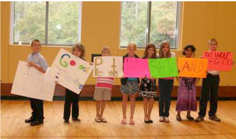
Below on the left and bottom 2 pics: at Sunday School, the St. David's Gospel theater presents a play for all to enjoy!