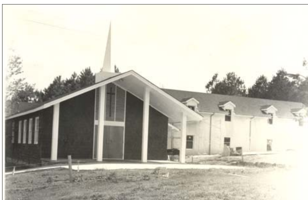
St. David's in 1975 when the "new education wing" was being built.

High Teas for our Senior Members: There will be two Teas to honor our senior members during our 50 th celebration. The first tea will be held on Monday, September 25, from 3:00-5:00 p.m. There will be a second tea offered on Thursday, October 12, from 3:00-5:00 p.m. Look for your invitations in the mail!